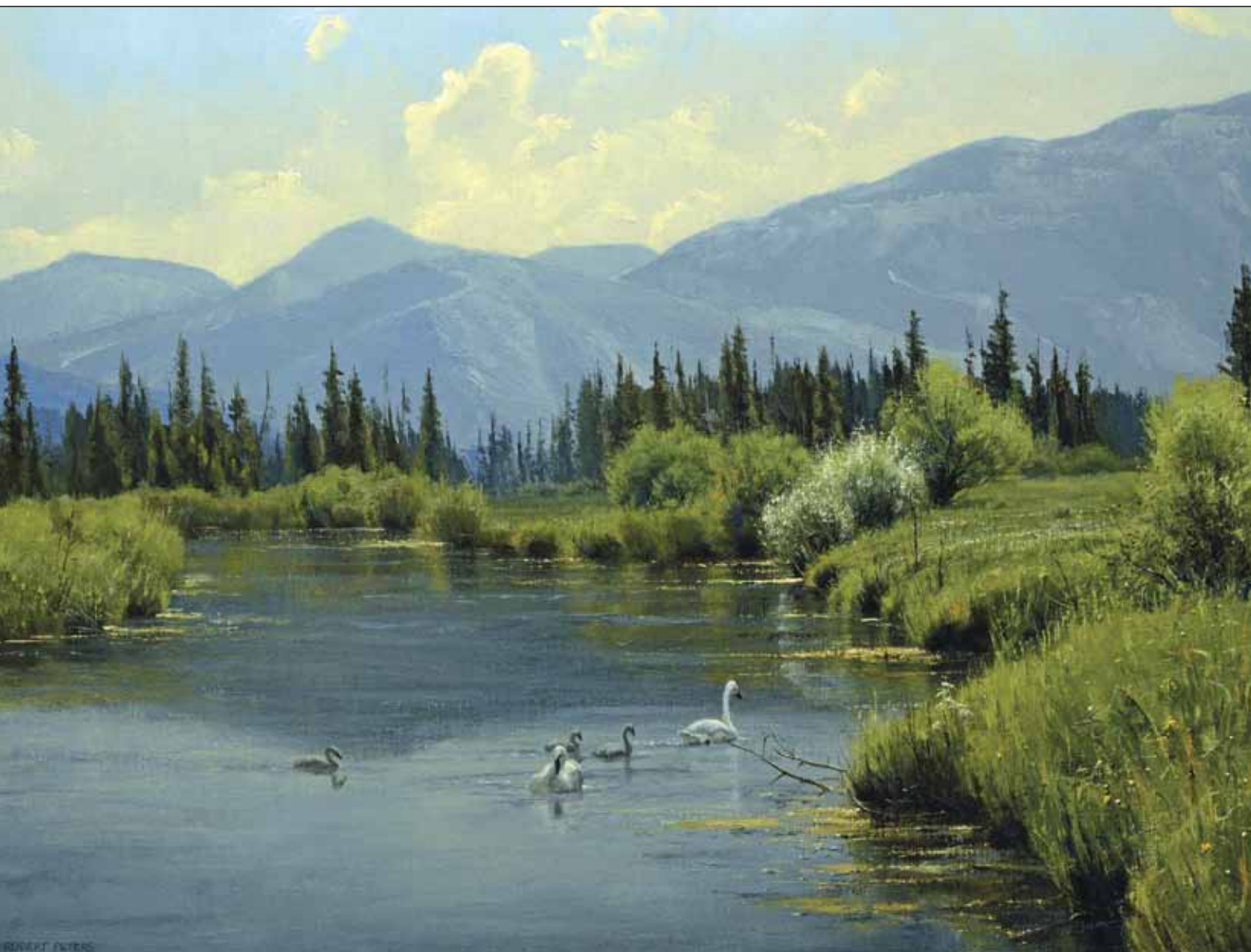
Sweet Day of Summer, oil, 30" by 40"

"This bucolic valley in Idaho surrounds the Snake River, just across the Wyoming border from Teton National Park."